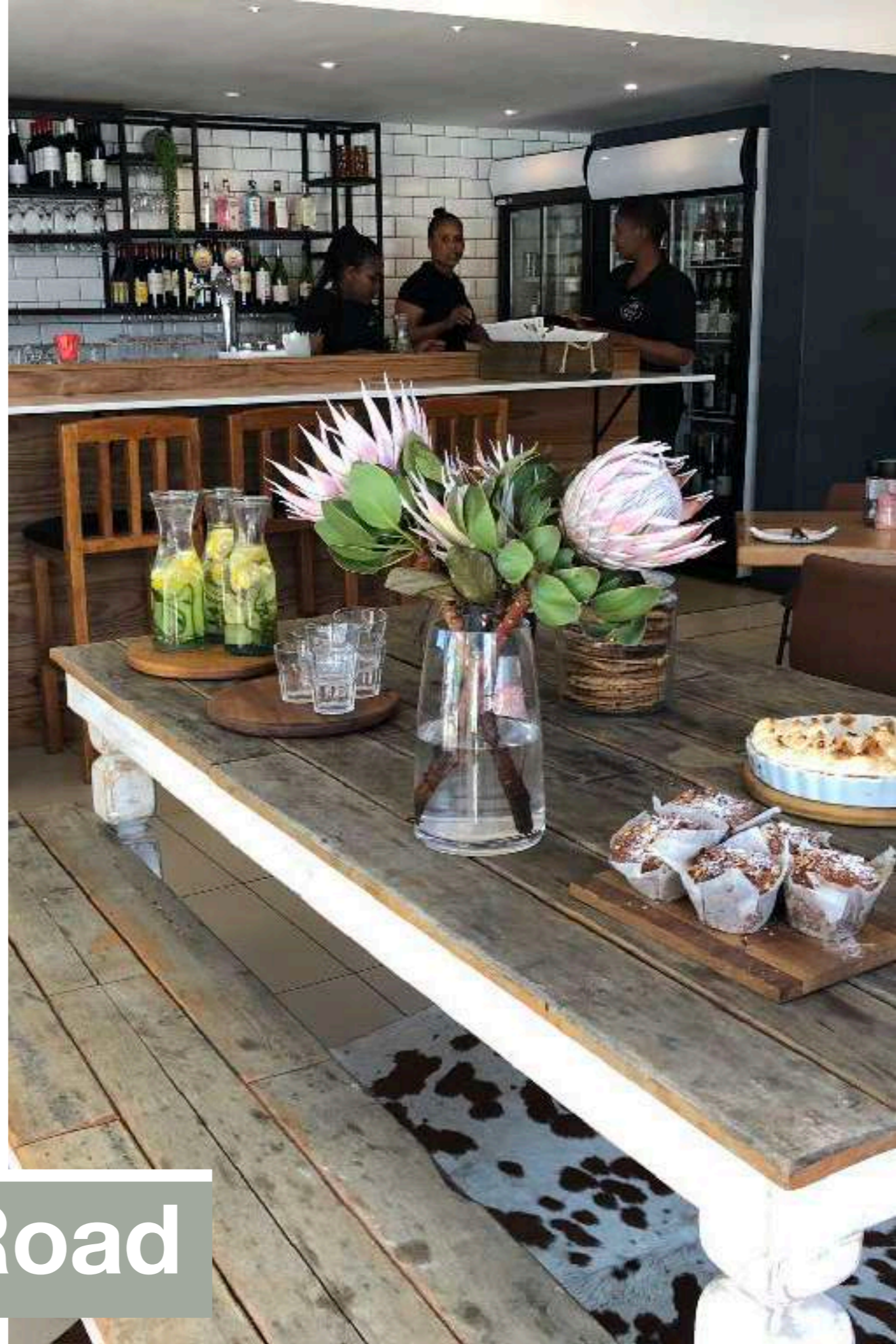
Old Transkei Road