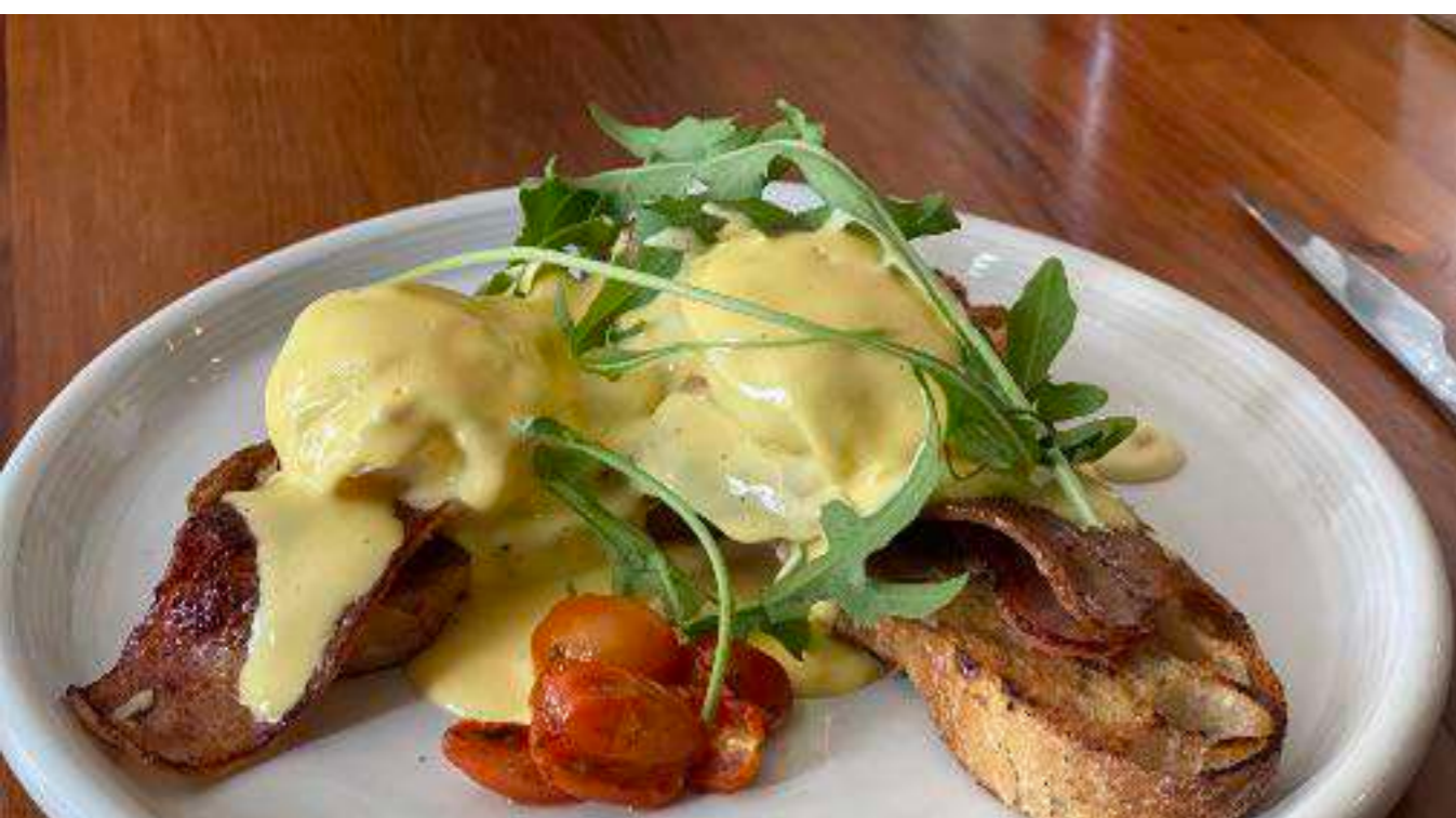
Berea / Selborne